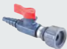
1. Pure water outlet valve