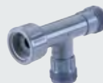
5. Pure water T-connector