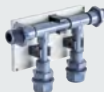
4. Pure water distributor block