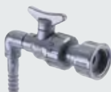
2. Pure water outlet valve