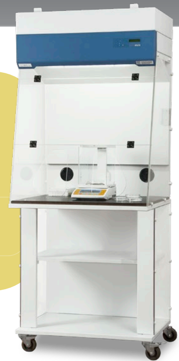
Esco Powdermax™ 1 Powder Weighing Balance Enclosure Model PW1-3A_