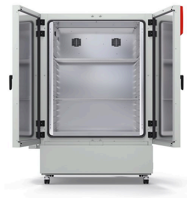
Model KBF-S ECO 720