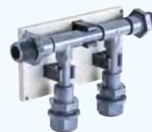
4. Pure water distributor block