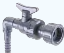
2. Pure water outlet valve