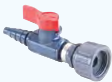
1. Pure water outlet valve