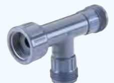
5. Pure water T-connector