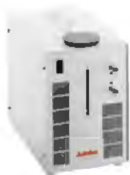
AC100 for working near ambient temperature

JULABO recirculating coolers and chillers are powerful solutions for a wide range of cooling requirements in laboratories and industrial environments. The instruments' short cool-down times and high efficiency make them an economic alternative to tap water cooling. The compact design offers a space saving installation. The instruments are equipped with a bright LED temperature display, easy to read even from a distance. W models are water-cooled for quiet operation and low heat waste. Warning and safety functions enable reliable, continuous operation. Filling and emptying is quick and easy via a well accessible filling and/or drain tap.