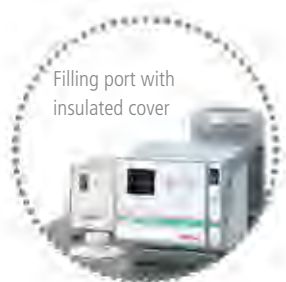
Filling port with insulated cover

JULABO ultra-low refrigerated circulators for heating and cooling in a working temperature range from -95 °C to +150°C. The instruments are suited for external temperature control applications and/or for temperature control directly in the circulator bath. The instruments offer particularly high heating and cooling capacities for short heat-up and cool-down times, even with large-volume, external applications. FP models with proportional cooling power control for energy savings and low heat waste. W models are water-cooled. With handle and/or rollers for easy transport and drain tap for easy emptying of the bath fluid. The instruments feature improved insulation, a level indicator as well as a heated bath cover plate to prevent condensation or ice build-up. Typical applications include the temperature control of jacketed reaction vessels, autoclaves, miniplant installations, kilo labs, freezing point determination, low temperature calibration, petroleum testing, etc.