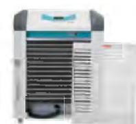
Drain tap located behind removable venting grid